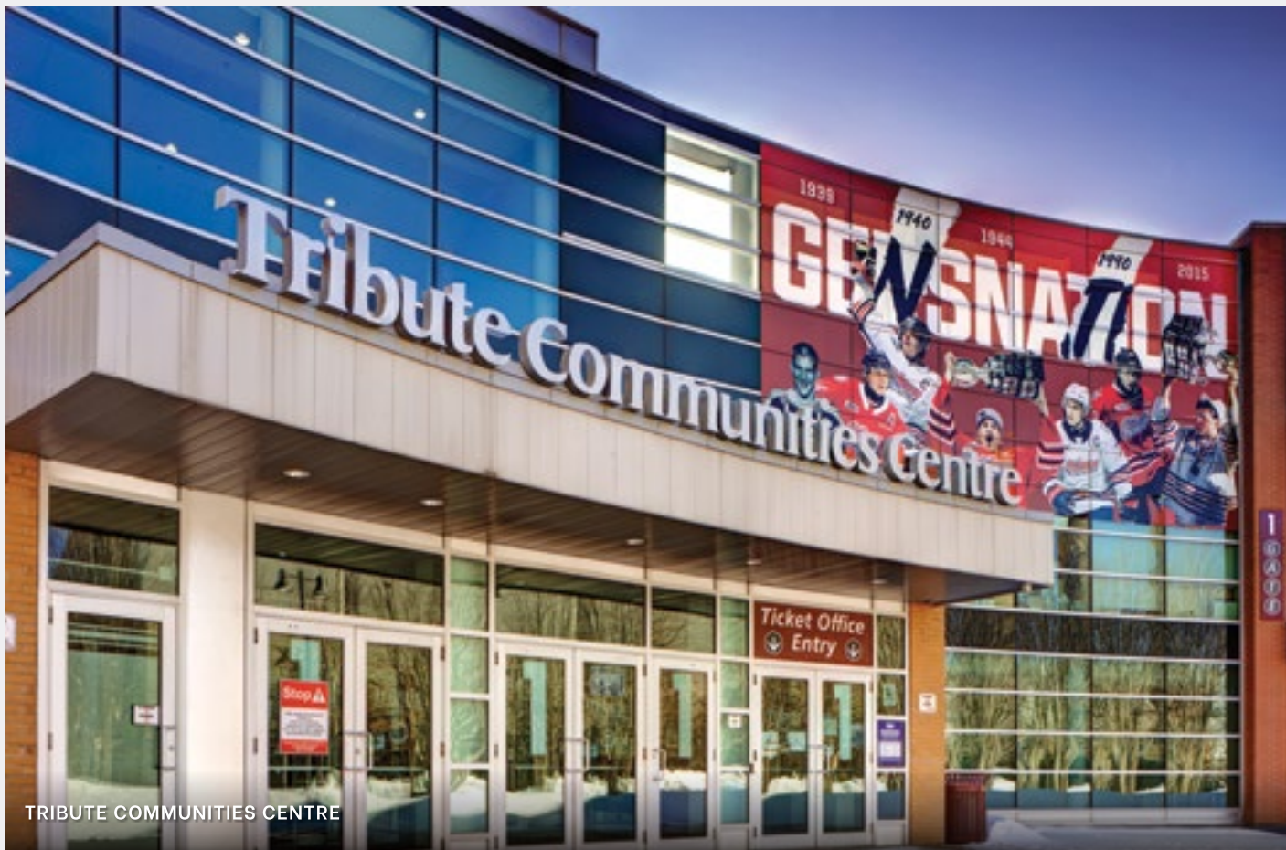
TRIBUTE COMMUNITIES CENTRE