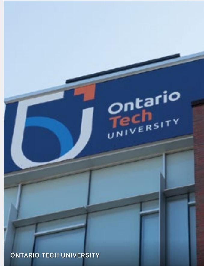
ONTARIO TECH UNIVERSITY