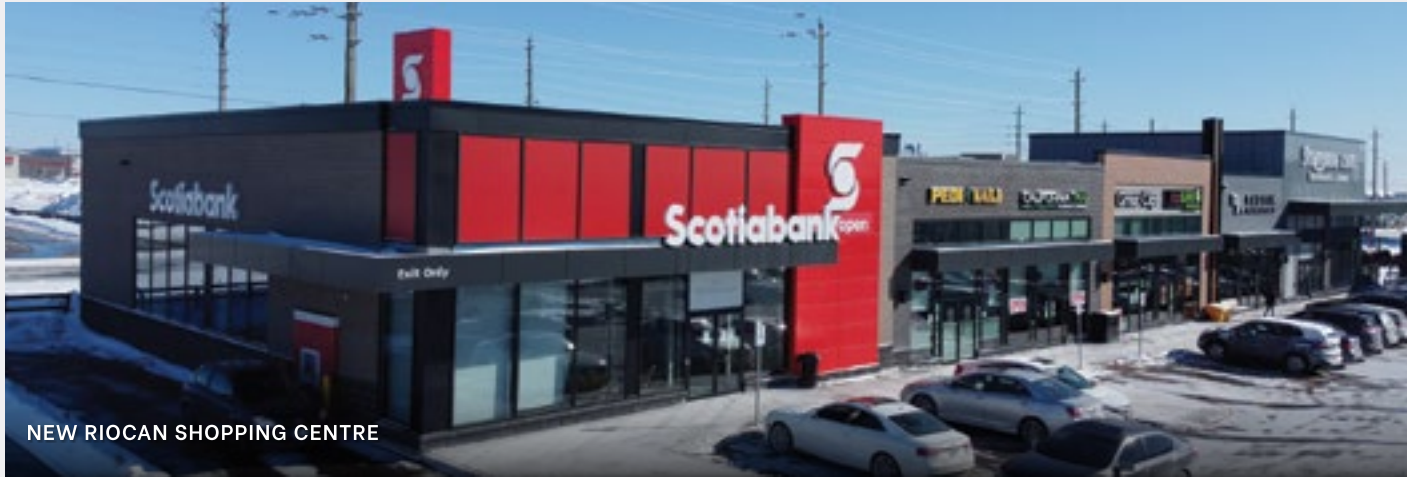
NEW RIOCAN SHOPPING CENTRE